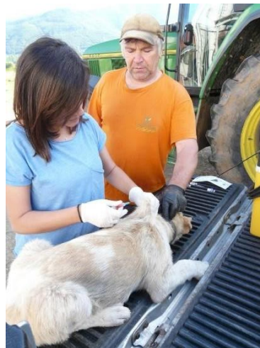
Figs 2. Provision of veterinary care to LGDs (clinical examination, vaccination, treatment for endo and ectoparasites, checking for microchip placement villages Sklitho, Asprogeia, Lechovo, Faraggi, Variko)