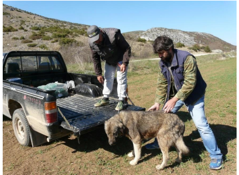
Figs 3. Puppies and adult LGDs at the time of donation (Villages Pelargos, Antigono and Faraggi).