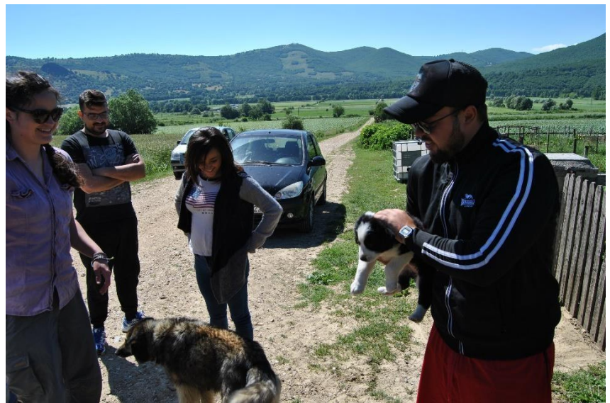
Figs 5. LGDs with their new owners (Villages Lechovo, Agioi Anargyroi, Pedino, Asprogeia, Lechovo)